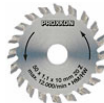
Table saw FET